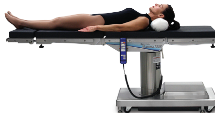
Lower Body Imaging