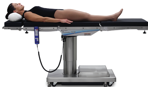
Upper Body Imaging