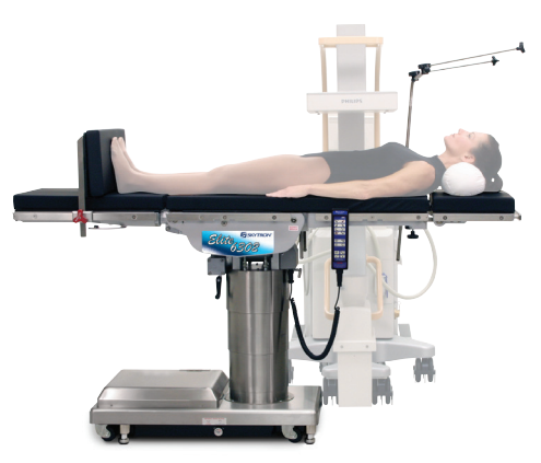
Upper Body Imaging