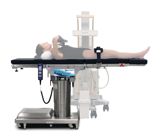
Lower Body Imaging