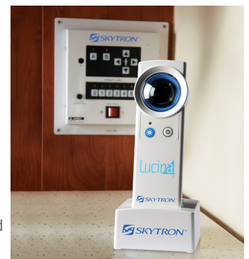
LED Strobe-Guided Positioning Wand and Wall Mounted Intensity Control