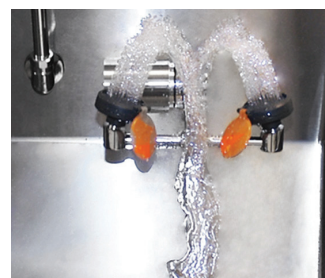
Optional Eye Wash (-EW) safety feature.