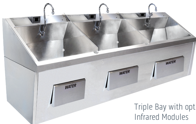
Triple Bay with optional Infrared Modules