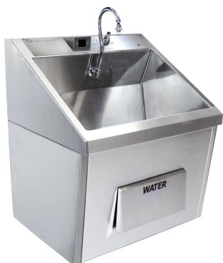
Single Bay with optional Infrared Module

Skytron's Stainless Steel Scrub Sinks provide quality, convenience and flexibility for every clinical need. Scrub Sinks are available with knee-kick and/or optional infrared module for "hands-free" operation. In addition, the optional Eye Wash (EW) feature provides a central, visible location to all staff, and saves valuable floor and wall space.