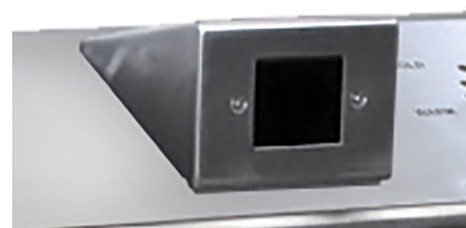
Optional Infrared Module (-IRM) conserves water usage.