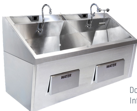
Double Bay with optional Infrared Modules and Eye Wash