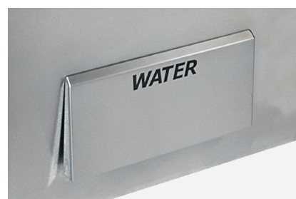
The Standard Knee Kick (-MK) panel is 16" wide and 8-1/2" high and is centered to the faucet for left or right knee operation.